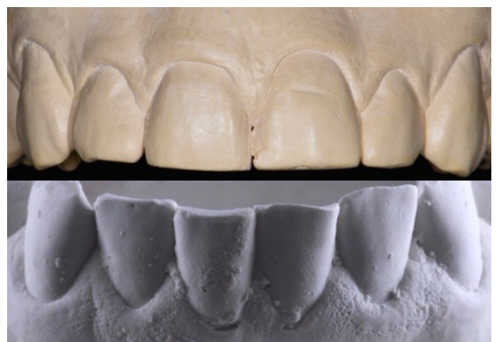
fig. 2, transference into a precise gypsum work model of the patient's mouth