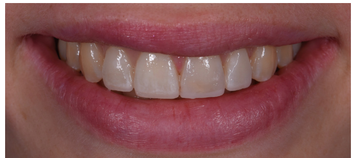
fig. 4, satisfying results