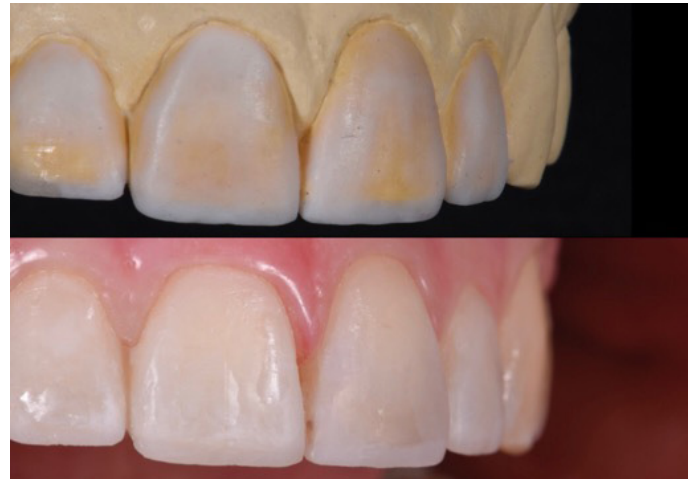
fig. 3, perfect mock-up can be made f.e. with Visalys® Temp, Kettenbach Dental

As such, we provide optimum working conditions for our technician to be able to create the wax work model and fully replicate it in the patient's mouth using the mock-up mold. The mold is guaranteed to be more realistic and detailed because it has derived from a high-precision model. This results in better communication between the doctor and the patient and the approval of the proposed restoration. The mold will then be used as an accurate guide in the preparation of our dental elements and finally we will be able to use it reliably as a provisional denture on invasiv cases while the permanent restorations are being made (fig. 3).