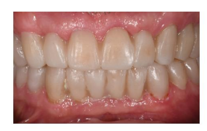
Fig. 3: Mock-up