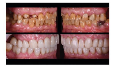
Fig. 9: Occlusion before and after treatment, lateral view