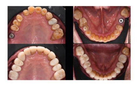
Fig. 10: Occlusal surface, before and after treatment