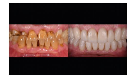
Fig. 8: Occlusion before and after treatment, front view