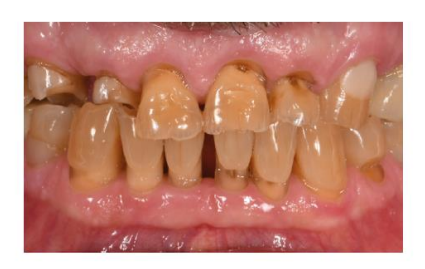
Fig. 1: Occlusion before treatment, front view