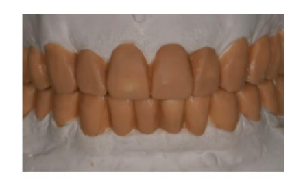
Fig. 2: Wax-up