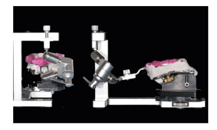
Fig. 6: Face bow transfer table with Futar® D