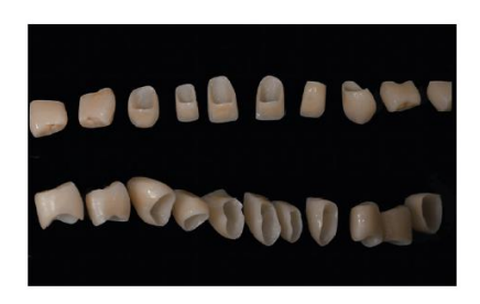
Fig. 7: Lithium silicate crowns and facets