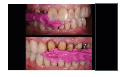
Fig. 5: Futar® D Bite Registration